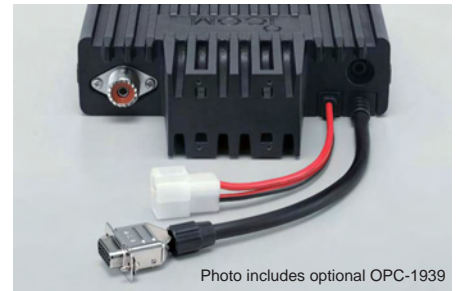
Photo includes optional OPC-1939

With the optional OPC-1939 D-SUB 15-pin ACC cable, the IC-F5021 series can be programmed to control an operating channel from an external device (up to 16 preprogrammed channels). The ACC connector also provides an ignition sensing function, external PTT, PC command, horn honk, audio output and modulated signal input depending on programming.